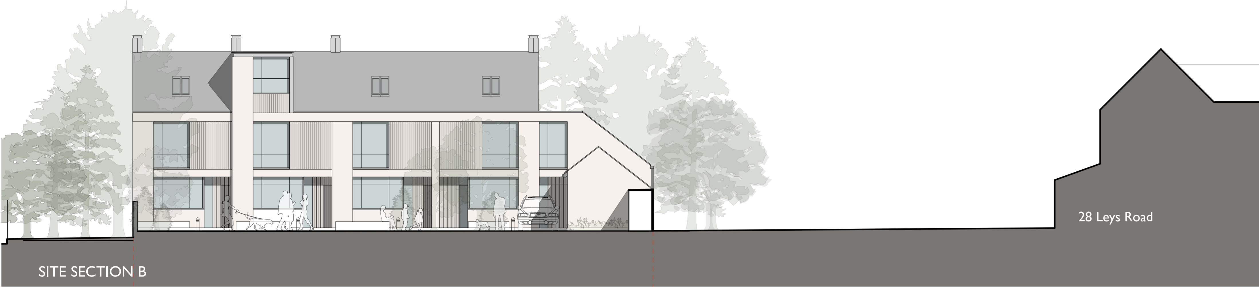
SITE SECTION B